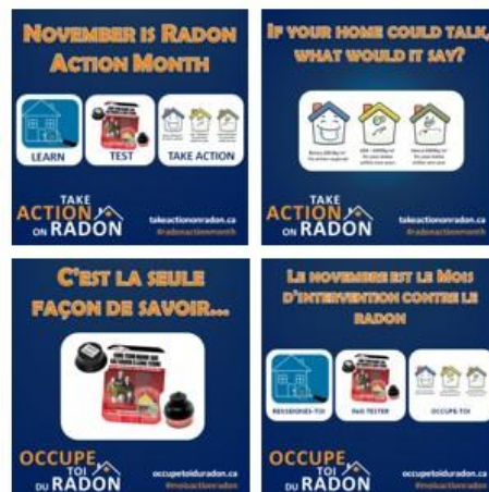
Facebook timeline images

Where to Buy Radon Test Kits in Canada / Où acheter les trousse de mesure de radon