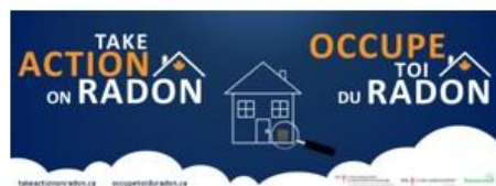
Facebook cover photo