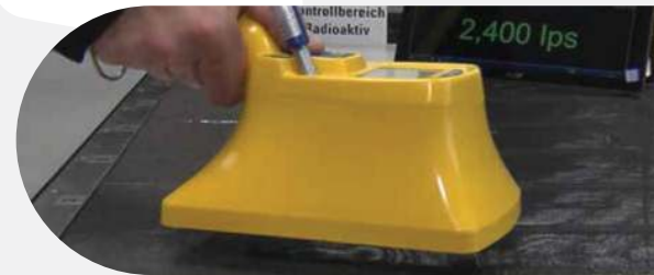
CoMo 170 with BT-module for wireless data transmission